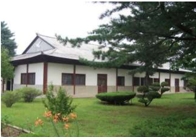
The building in which the Korean Armistice Agreement was signed now houses the North Korean Peace Museum.

No peace treaty was signed, which means that the Korean War has not officially ended. The armistice established the Korean Demilitarized Zone (DMZ). The