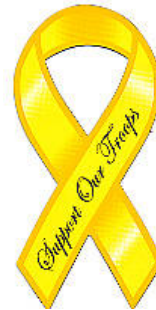
Yellow Ribbon $75 / Hundred