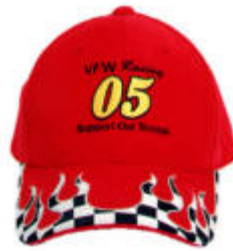
Cap $180 / Dozen