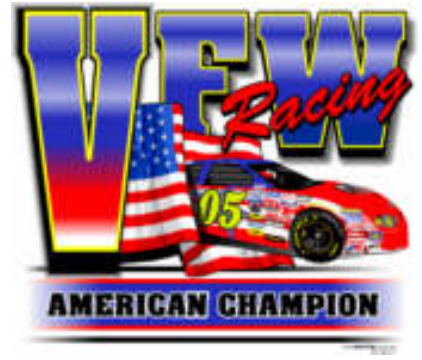
T-Shirt $120 / Dozen

Shirts can be ordered in any combination of sizes to create one dozen.