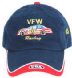
Cap $180 / Dozen