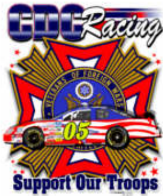
T-Shirt $120 / Dozen