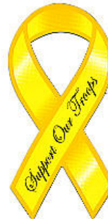
Yellow Ribbon $75 / Hundred