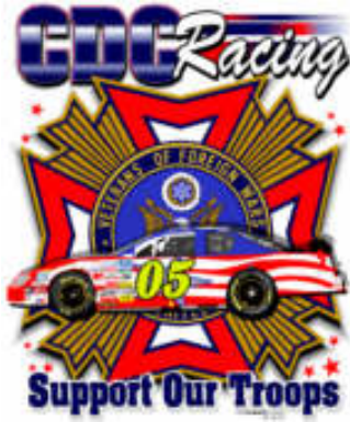
T-Shirt $120 / Dozen