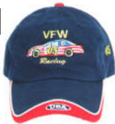
Cap $180 / Dozen