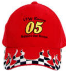
Cap $180 / Dozen