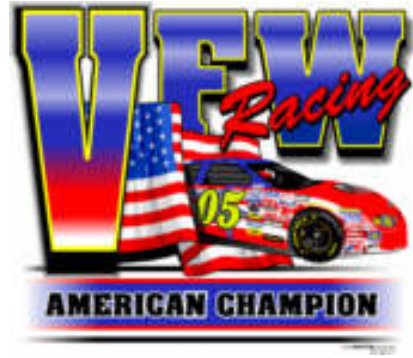
T-Shirt $120 / Dozen

Shirts can be ordered in any combination of sizes to create one dozen.